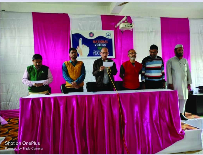
Shot on OnePlus Powered by Triple Camera