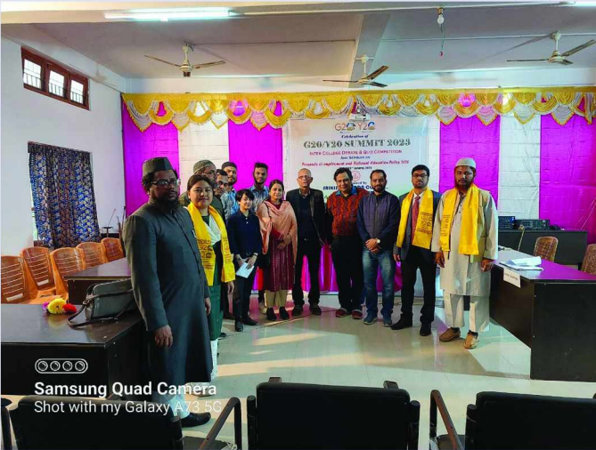
Samsung Quad Camera Shot with my Galaxy A73 5G