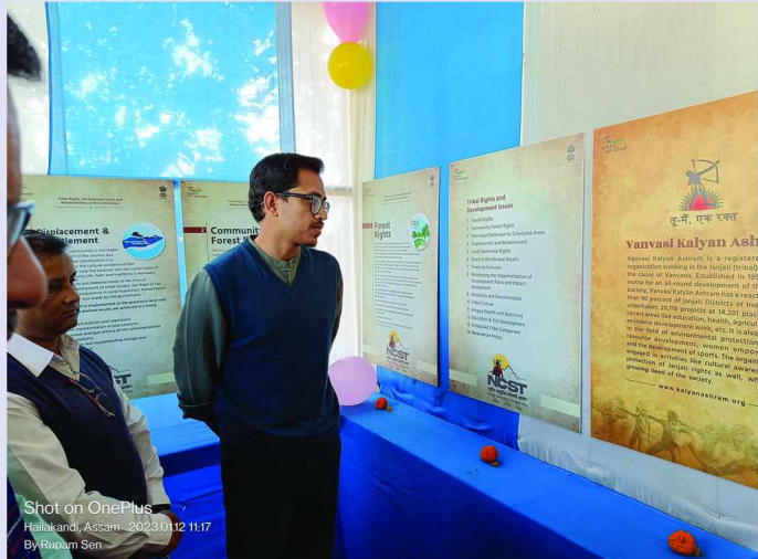
Shot on OnePlus Hailakandi, Assam - 2023.01.12 11:17