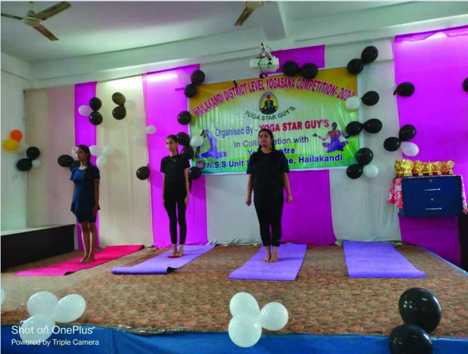
Shot on OnePlus Powered by Triple Camera